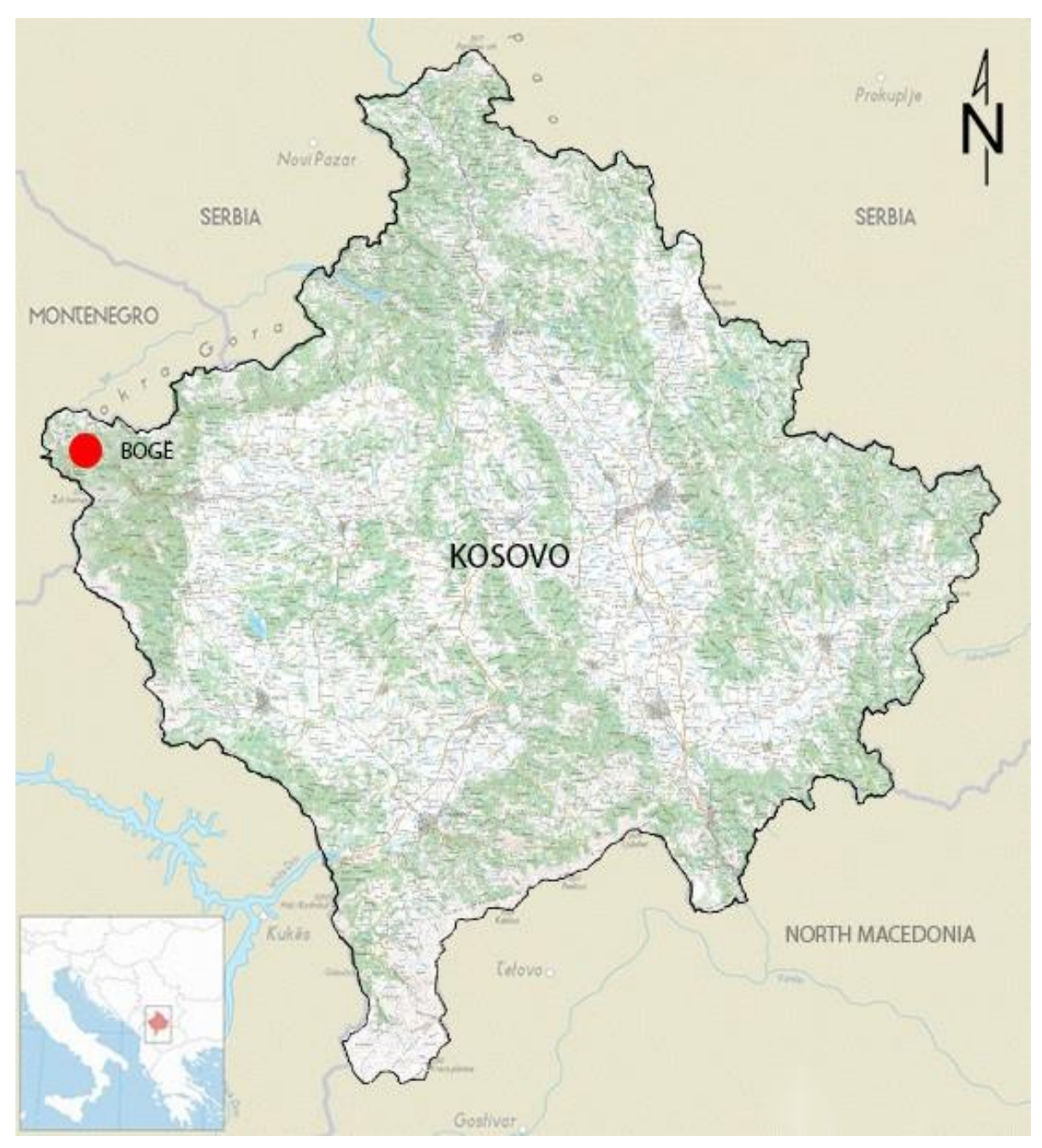
Figure 2. Map of sampling station, Bogë Stream, Rugovë Mountain, Kosovo.