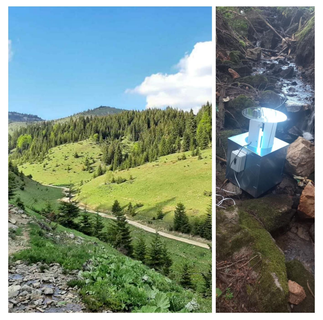
Figure 1. Left: Type locality of Rhyacophila siparantum Ibrahimi, Bilalli & Kučinić, 2021: Bogë Stream, Rugovë Mountain, Kosovo; Right: Ultraviolet light trap deployed on site for adult caddisfly collection.

Description. General morphology. Head and appendages brown. Thorax brown dorsally, and lighter ventrally. Legs yellowish brown, spurs brown, palpi light brown. Abdomen dark brown dorsally with irregular lines and patches and pale ventrally. Wings generally brown, with patches of dark brown along the wing venation. Forewing length 11.5 - 11.9 mm, spur formula 3-4-4. Antennae brown. There is a ventral tooth on the abdominal segment VII; triangularly shaped in lateral view, and considerably smaller than abdominal tooth on segment VII in males.